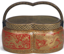
· 故宫博物院藏文物 · 朱漆描金龙凤纹手炉

The hand warmer is a small utensil used by the children of rich families in ancient China to warm their hands in winter. It is used for warming hands and dredging blood for writing, writing and painting. In the Qing Dynasty, this was a kind of imperial item and a winter hand warmer for the emperor's concubine. We are one of the biggest hand warmers manufacturers in the industry.